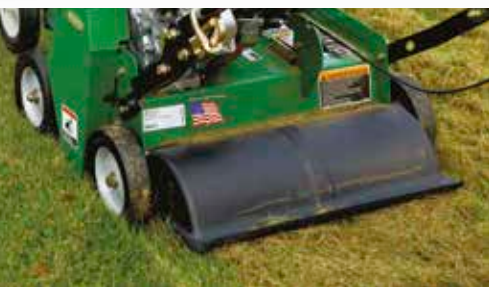
BUBBLE SHIELD PREVENTS THATCH BUILDUP