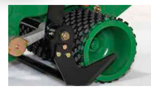
KNOBBY TREAD DRIVE TIRES MOLDED TO HUB