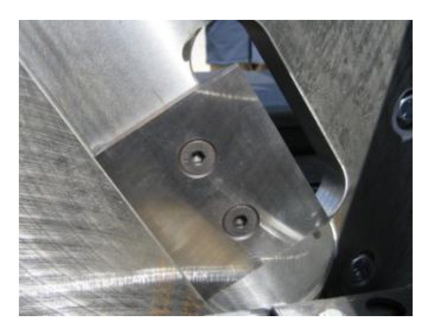
Reversible and replaceable cutters